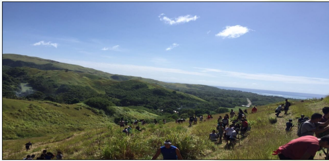
GEO was one of many partners at the DoAg tree planting event.