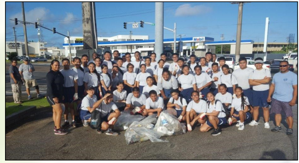
GEO staff/JFK ROTC—Islandwide cleanup