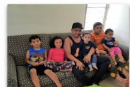
FAMILIES WITH CHILDREN